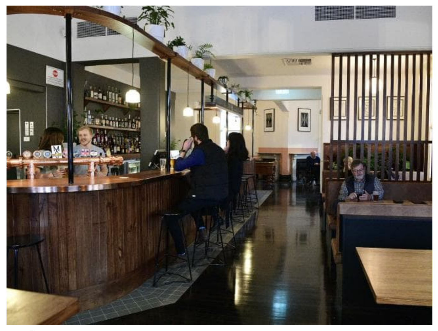
The Stag Public House promises to be the kind of place where the barman knows you by name.