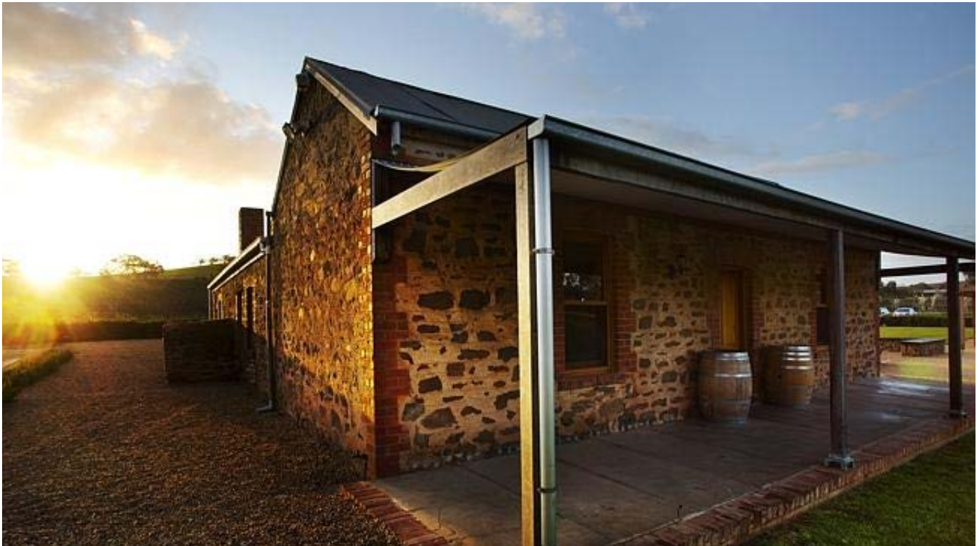
Hentley Farm in the Barossa Valley.

Restaurant of the Year in 2013, Hentley Farm captivated us again. If anything, its connection to the surrounding region is more focused than ever.