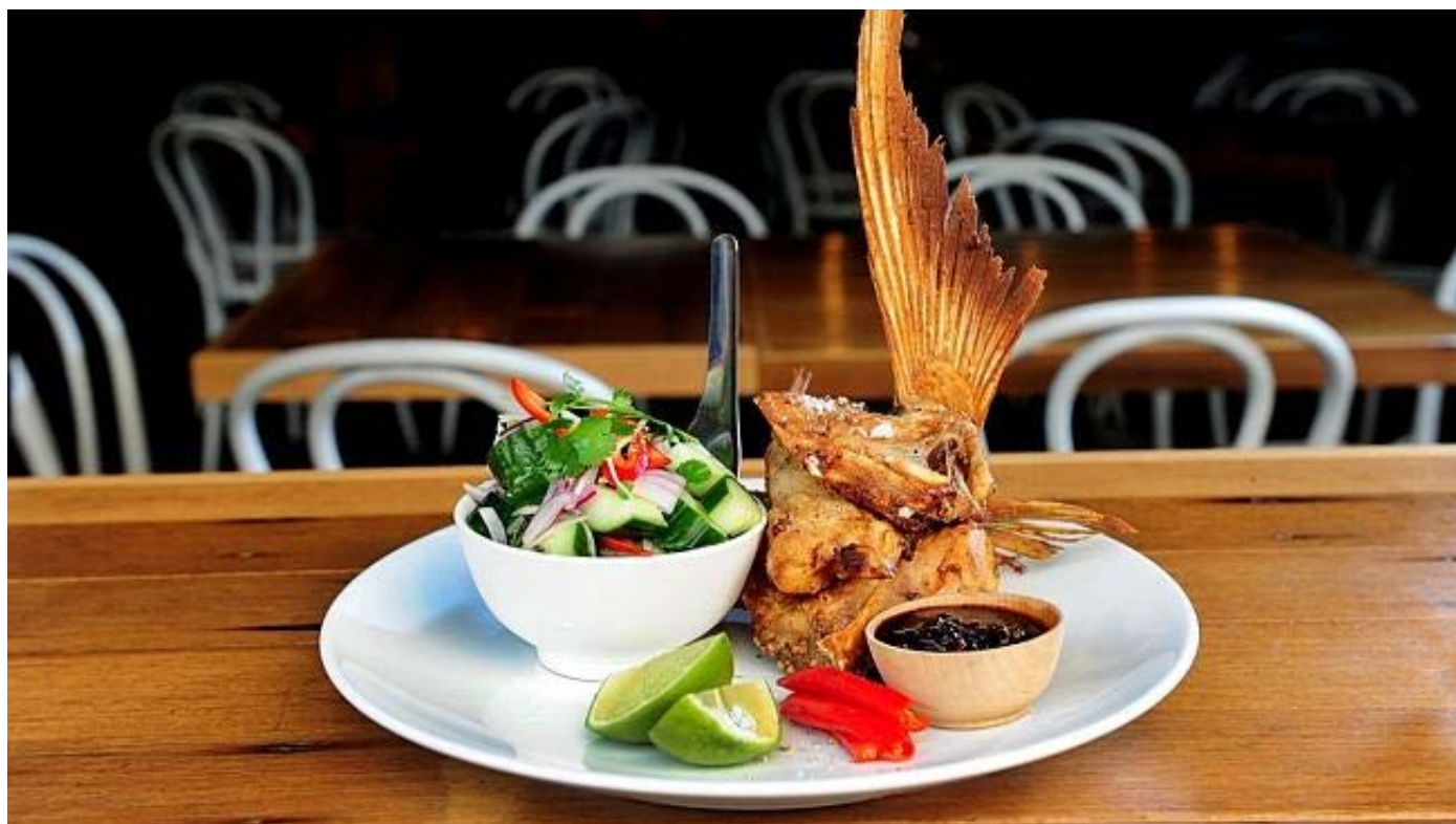
Crispy Fried Snapper Wings, Cucumber relish and Jeow at Peel St.