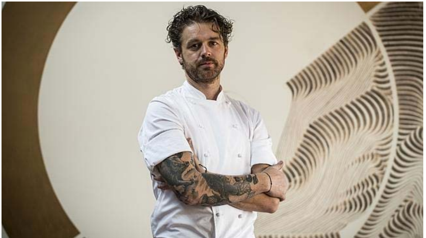
Chef Jock Zonfrillo pictured at his restaurant Orana, Rundle Street. Orana has been named as SA's best in the 2014 restaurant awards.