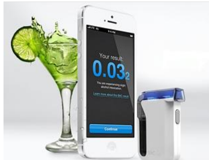
BACTrack is a Bluetooth connected device that graphs alcohol levels.