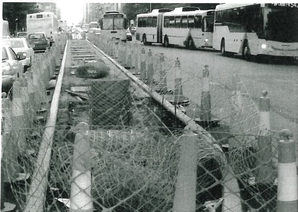
The second stage of the Grenfell Street Greening Project: currently underway.

The second stage to the Grenfell Street Greening is now occurring. This section of the city should be a template for ongoing work for the Green City that the Council says it desires.