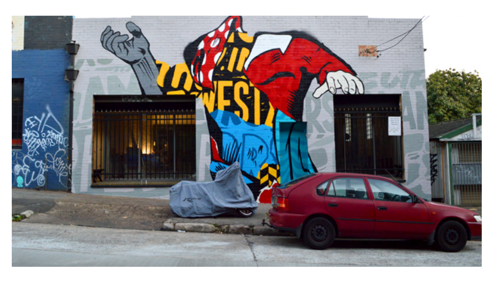
A Sydney wall by Numskull interfaces with graffiti 'tags' to the left