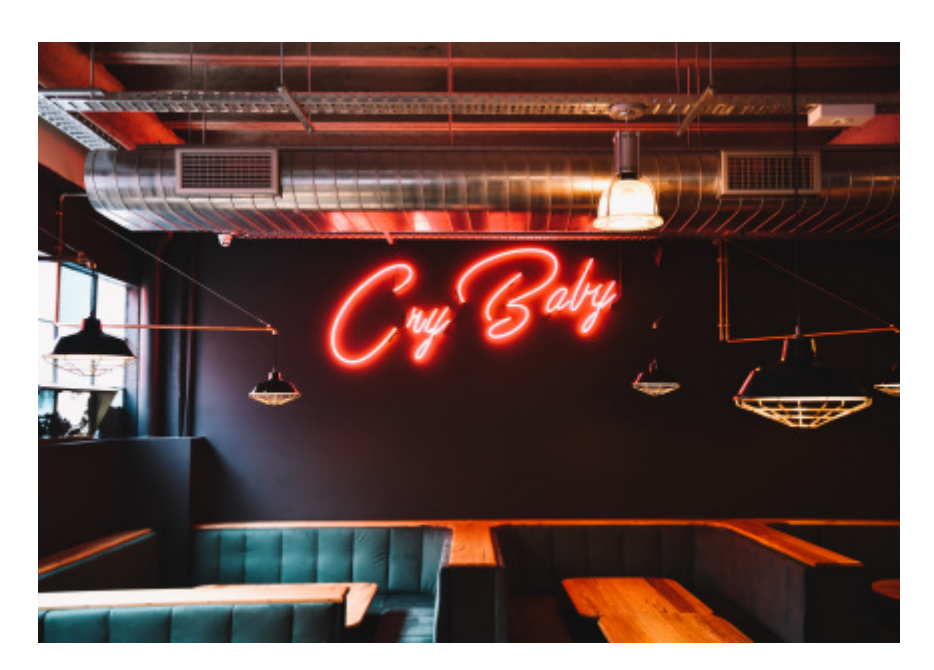
Cry Baby FOOD & DRINK

Get the best of Broadsheet straight to your inbox