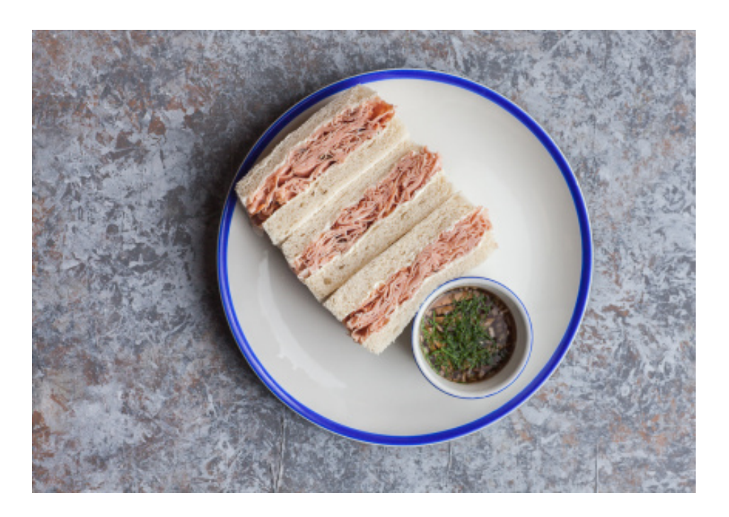
Where to Find Adelaide's Best Sandwiches FOOD & DRINK