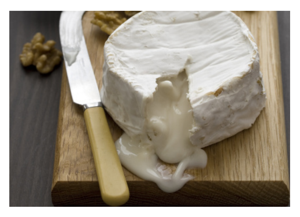
CheeseFest + Ferment Announces 2018 Program FOOD & DRINK