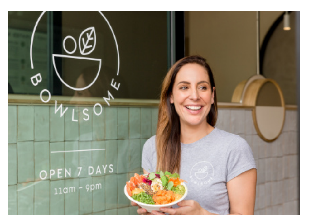
Bowlsome Is Coming to the CBD FOOD & DRINK