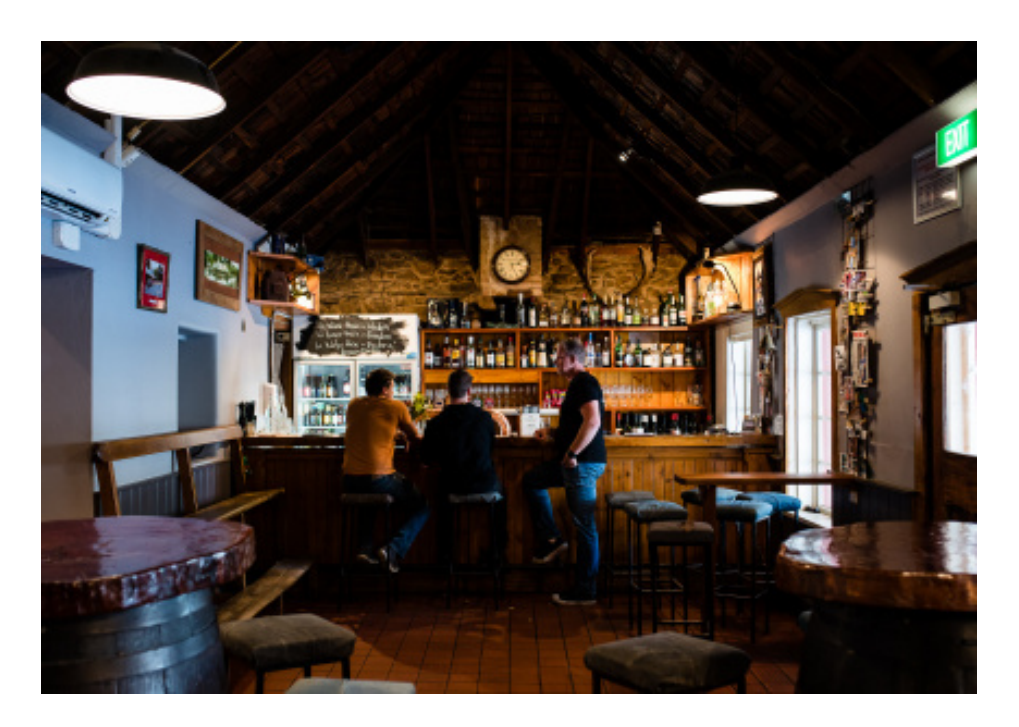
Here's Where You Can Buy a Parma for a Farmer FOOD & DRINK