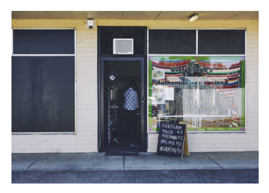
Taco Quetzalcoatl's FOOD & DRINK